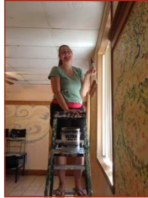
Women Everywhere blessed us on their annual volunteer paint project.