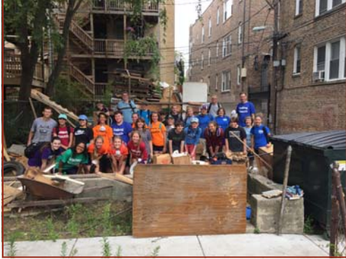
40 youth from 4th Presbyterian Church helped with a major moving project! So thankful for their hard work!