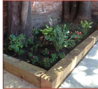
Chicago Hopes for Kids, tutoring our New Life children, also donated and planted flowers at New Life.