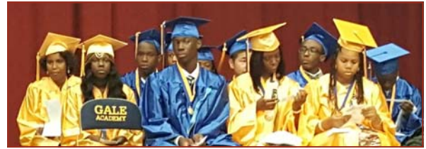
2016 8th Grade Graduates from Gale Academy, local Chicago Public School