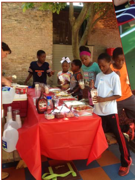
And ice cream sundaes topped of the grand opening. A day of blessings.