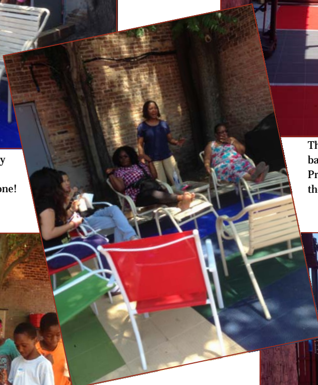
Moms and Staff relax and enjoy watching the kids play.