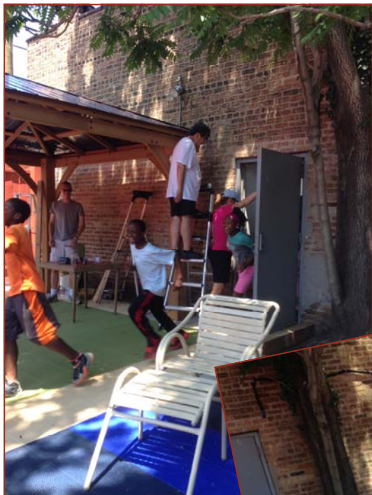
Kids first look at their new play yard and the Grand Opening. Smiles and cheers from everyone!